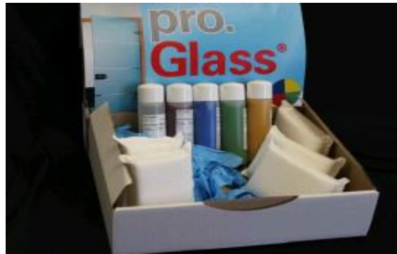
pro.Glass® Color Standard Box